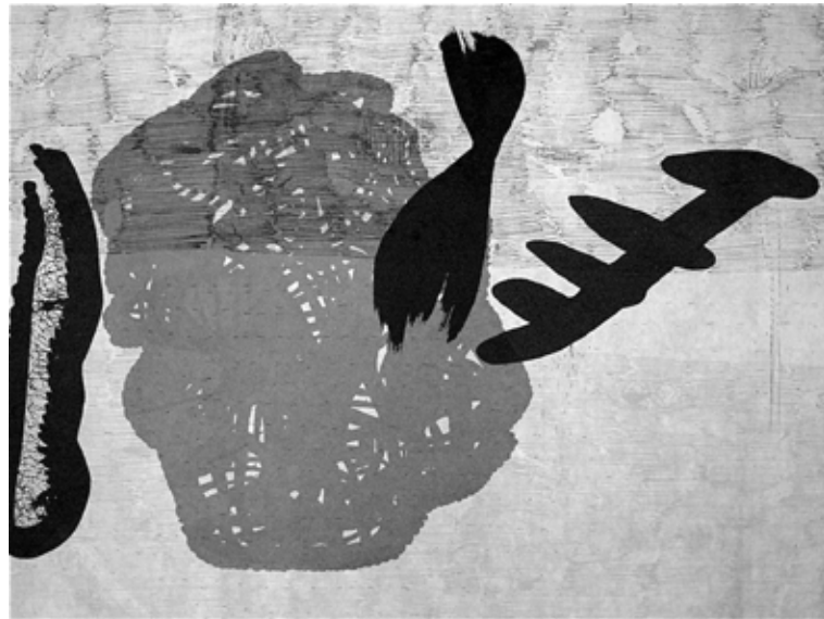
Kai Chan, Seaweeds and Other Floating Things (detail), screenprint on rice paper, 48 x 178 cm, 2009