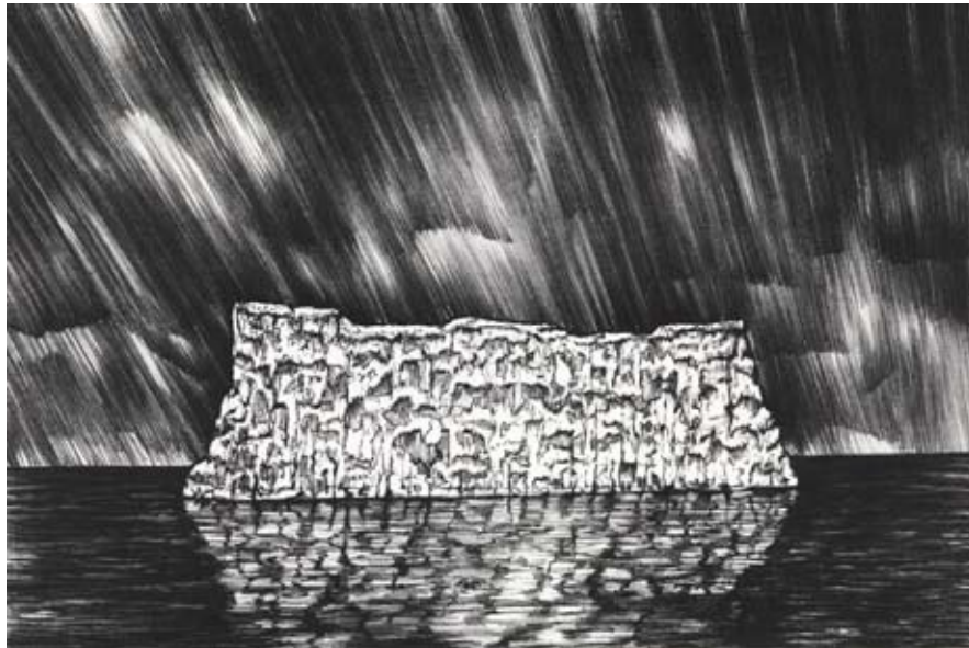
Endi Poskovic, Untitled iceberg , stone lithograph in one color, 16" x 21", 2009